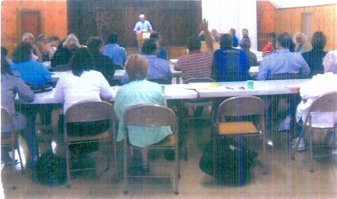
Picture of All Day Saturday September 15, 2007 Moses Lake ARC Conference on Immigration